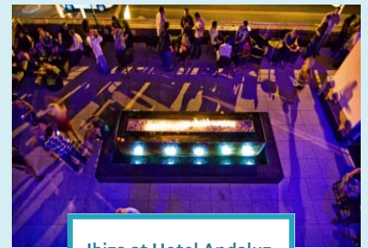
Ibiza at Hotel Andaluz

Sponsored by the Association of Bankruptcy Judicial Assistants